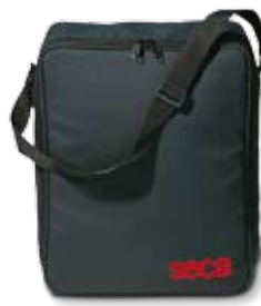
seca 421 carry case.