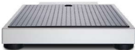
Compact design and light weight for great carrying comfort and universal usage.