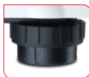
Leveling base on the bottom of the scale base for safe and secure placement.