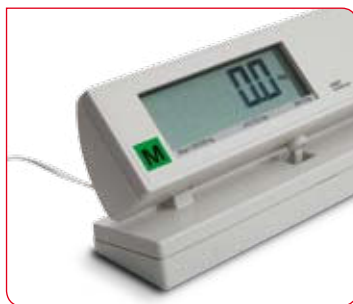
Adjustable tilt angle for convenient handheld, desk or wall use.