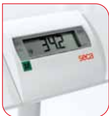
The patient's BMI can be determined when his height is entered.

Experts predict that, by the year 2040, half of the world population will have a BMI of over 30 kg/m which means obesity. Here the seca 635 with its integrated BMI function helps to evaluate the nutritional condition and makes early action possible.